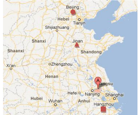
Figure 1. The spot that the capital letter "A" indicates is where Zhenjiang city is; the square indicates Hangzhou; the dot, Beijing; the triangle, Jinan.

dialects of Chinese and each of them may influence second language production in different ways. Two of the major ten dialect areas will be focused in this study. One is Guan and the other is Wu. Since each dialect possesses several subtypes and it is impossible to cover them all, two subtypes in each area, which makes four dialects in total, will be focused on. For Guan dialect, Beijing dialect and Shandong dialect are chosen and for Wu dialect, Hangzhou dialect and Zhenjiang dialect are chosen. The geological locations are demonstrated in Figure 1.